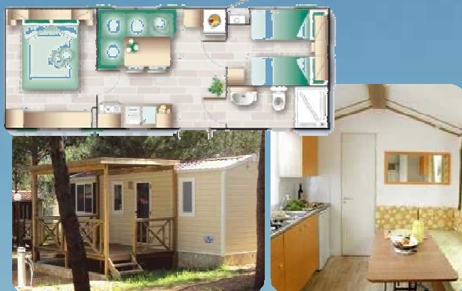
Mobile home «maxi» 4/5 pax