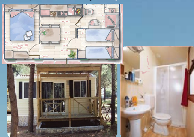
Mobile home «family» 2/4 pax